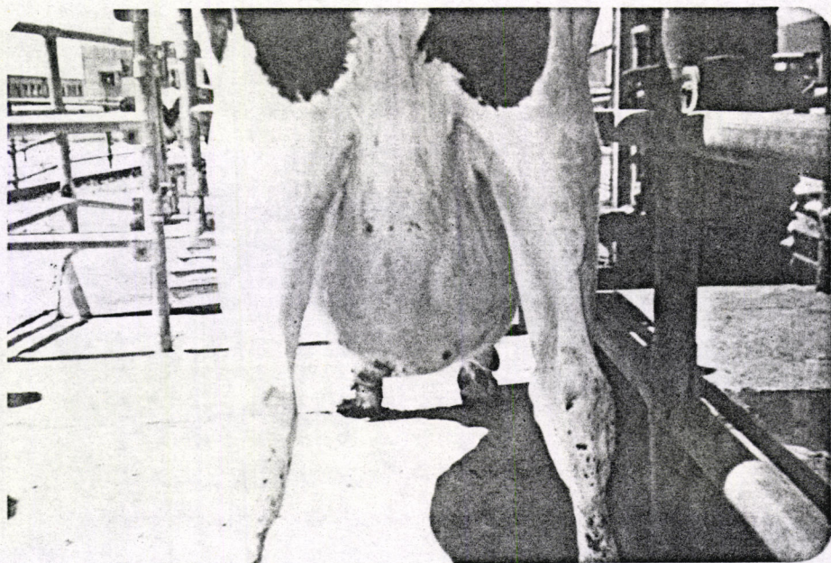
Fig. 2 : Mammary gland of cattle infected with Nocardia asteroides showing draining sinus tract.